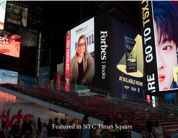
Featured in NYC Times Square